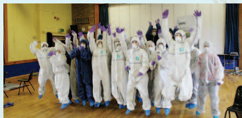
CSI Team Conclusion