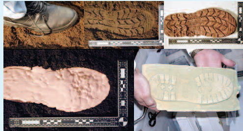
Footwear impressions and analysis