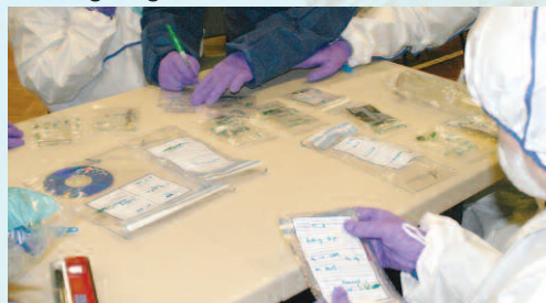
Trace evidence collection