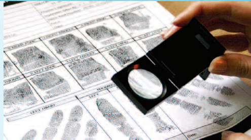
Observing Fingerprint impressions

Supporting ECM (Every Child Matters) Agenda Supporting the STEM Agenda