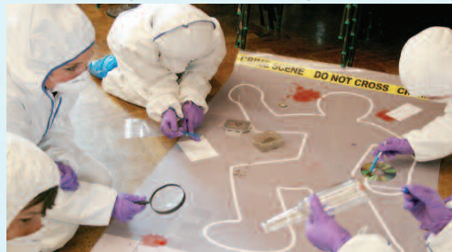
Investigating a Crime Scene Scenario